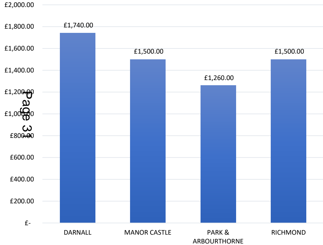
Agreed funding per ward area (£)